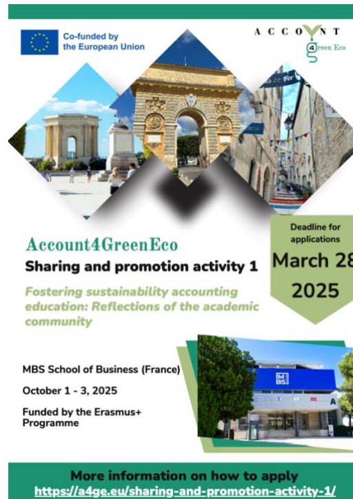
Figure 4. SP1 poster

Additionally, each Project partner (particularly higher education institutions) will share the information within their national academic networks. Namely: